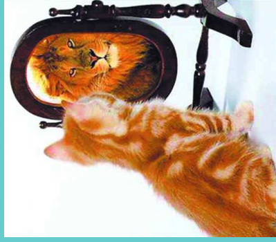
Transformation from the inside out!!!